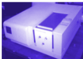
UV- Visible Spectrophotometer (Hitachi U 2910 )