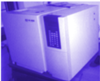
Gas Chromatograph (GL sciences 4000, Japan)