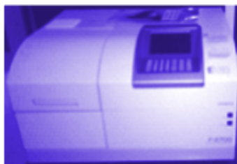
Fluorescence Spectrophotometer (Hitachi, F 2700)