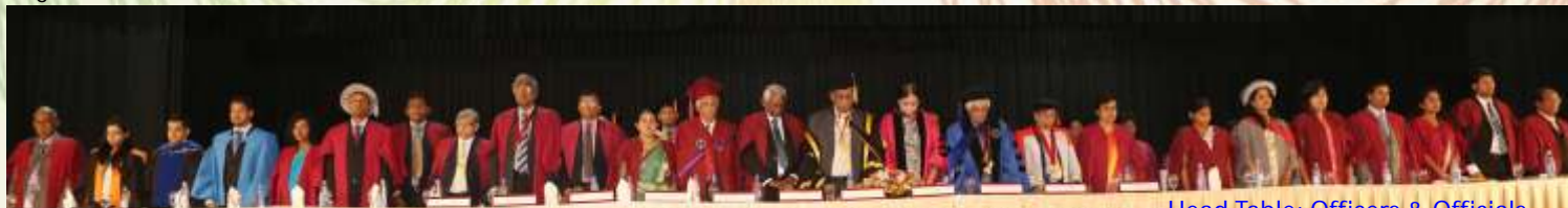
Head Table: Officers & Officials Behind: Academic Staff